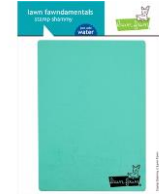
Lawn Fawn STAMP SHAMMY Cleaner LF1045