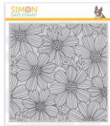
*Simon Says Stamp Cosmos Bloom...

Here are the supplies used. Where available I use Compensated Affiliate Links , which means if you make a purchase through my link, I receive a small commission at no extra cost to you. Thank you so very much for your support, I truly appreciate it.