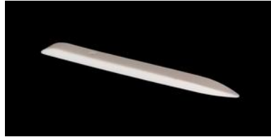
Simon Says Stamp SMALL TEFLON BONE...