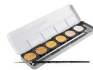
Finetec MICA WATERCOLOR PEARLESCENT...