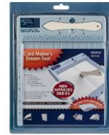
Scor-Pal MINI SCOR- BUDDY Scoring...