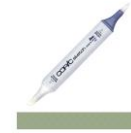
Copic Sketch Marker G94 GRAYISH OLIVE...