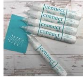
Gina K Designs CONNECT GLUE Adhesive...