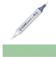
Copic Sketch Marker YG63 PEA GREEN...