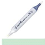
Copic Sketch MARKER G21 LIME GREEN