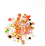
Simon Says Stamp Sequins SPRING...