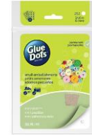
252 GREEN 33709 MINI GLUE DOTS 21...