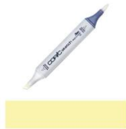
Copic Sketch Marker Y13 LEMON YELLOW