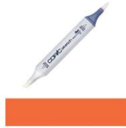
Copic Sketch Marker YR18 SANGUINE...