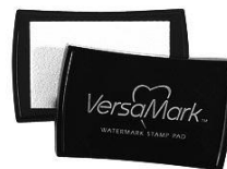
Tsukineko Versamark EMOSS INK PAD...