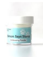
Simon Says Stamp EMOSSING POWDER...