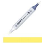
Copic Sketch MARKER Y15 CADMIUM YELLOW