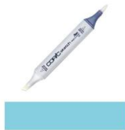
Copic Sketch Marker BG05 HOLIDAY BLUE