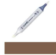
Copic Sketch Marker E77 MAROON Dark Red