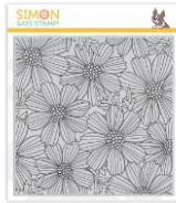
Simon Says Cling Stamp COSMOS BLOOM...

Here are the supplies used. Where available I use Compensated Affiliate Links, which means if you make a purchase through my link, I receive a small commission at no extra cost to you. Thank you so very much for your support, I truly appreciate it.