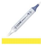
Copic Sketch Marker Y19 NAPOLI YELLOW...