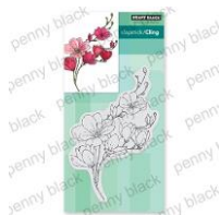
Penny Black Cling Stamp HARMONY 40-682

Please note this list of supplies covers both the cards shared here today