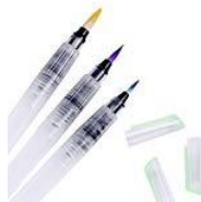
Ohuhu Water Coloring Brush Pens, Set...