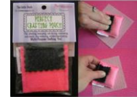
Perfect Crafting Pouch (Small)