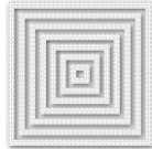
Simon Says Stamp STITCHED SQUARES...