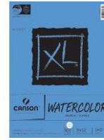
Canson XL WATERCOLOR PAPER 9x12 140lb...