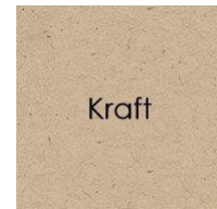
Gina K Designs - Cardstock - Kraft