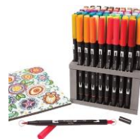
Tombow DUAL BRUSH MARKER 96 PIECE SET...