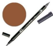
Tombow - Dual Tip Marker - Chocolate 969