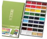
Zig Kuretake Gansai Tambi 36 COLOR SET