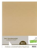
Lawn Fawn KRAFT Cardstock LF1747