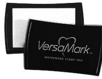
Tsukineko VersaMark EMB OSS INK PAD...