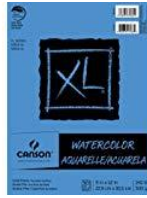
Canson XL Watercolor Paper Pad...