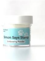
Simon Says Stamp EMB OSSING POWDER...