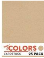
My Colors Cardstock - My Minds Eye -...