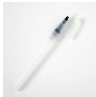
Medium WATERCOLOR BRUSH Pen MWCBP101