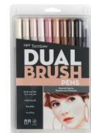
Tombow PORTRAIT Dual Brush Pens 10...