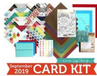
Simon Says Stamp Card Kit of The...

Here are the supplies used. Where available I use Compensated Affiliate Links, which means if you make a purchase through my link, I receive a small commission at no extra cost to you. Thank you so very much for your support, I truly appreciate it.