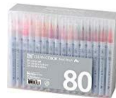
Kuretake Zig Clean Color Real Brush...