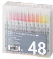
Zig CLEAN COLOR 48 SET Real Brush...