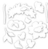
Simon Says Stamp LOOK FOR THE...