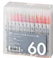
Kuretake Clean Color Real Brush...