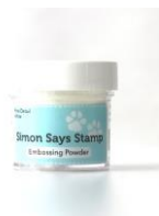
Simon Says Stamp EMBOSSING POWDER...