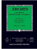
Arches COLD PRESSED WATERCOLOR PAD...