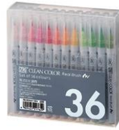
Zig CLEAN COLOR 36 SET Real Brush...