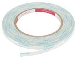
Scor-Tape 0.25 Inch Crafting Tape