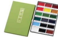
Zig Kuretaka Gansai Tambi 18 COLOR SET