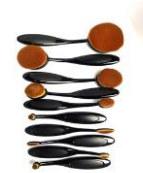
Picket Fence Studios LIFE CHANGING...