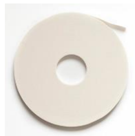
Simon Says Stamp BIG MOMMA FOAM TAPE...