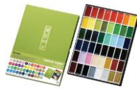
Zig Kuretaka Gansai Tambi 48 COLOR...