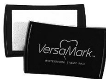
Tsukineko Versamark EMBOSS INK PAD...