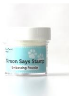
Simon Says Stamp EMBOSSING POWDER...