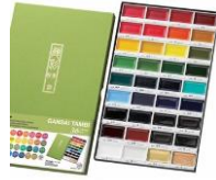
Zig Kuretaka Gansai Tambi 36 COLOR SET