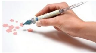
We R Memory Keepers QUICKSTIK...