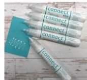
Gina K Designs CONNECT GLUE Adhesive...