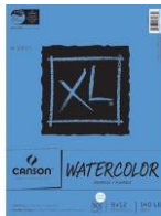
Canson XL WATERCOLOR PAPER 9x12 140lb...