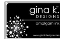
Gina K Designs OBSIDIAN Amalgam Ink...