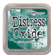
Tim Holtz Distress Oxide Ink Pad PINE...