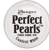
Ranger Perfect Pearls CONFETTI WHITE...