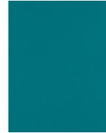
Gina K Designs TRANQUIL TEAL 8.5x11...