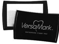
Tsukineko Versamark EMBOSS INK PAD...