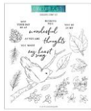
Concord & 9th SONGBIRD Clear Stamp...

Here are the supplies used. Where available I use Compensated Affiliate Links, which means if you make a purchase through my link, I receive a small commission at no extra cost to you. Thank you so very much for your support, I truly appreciate it.