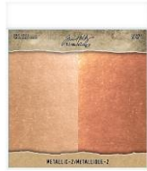
Tim Holtz Idea-ology 8 x 8 Paper...