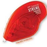
Tombow XTREME Permanent Adhesive Tape...