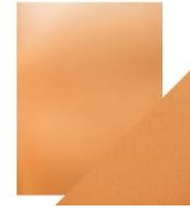
Tonic COPPER MINE Mirror Card Effect...