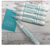
Gina K Designs CONNECT GLUE Adhesive...