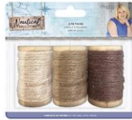
Crafter's Companion NAUTICAL Jute...