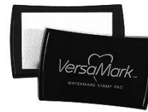
Tsukineko Versamark EMBOSS INK PAD...