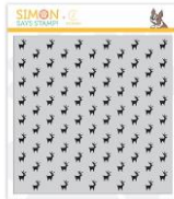
CZ Design Cling Stamps REINDEER...

Here are the supplies used. Where available I use Compensated Affiliate Links, which means if you make a purchase through my link, I receive a small commission at no extra cost to you. Thank you so very much for your support, I truly appreciate it.