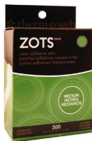
Zots MEDIUM Clear Adhesive Dots...