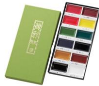
12 Color Set, Gansai Tambi