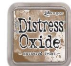
Gathered Twigs, Ranger