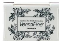
VersaFine Ink Pad, Onyx