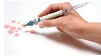
We R Memory Keepers QUICKSTIK...