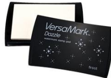
Tsukineko Versamark FROST DAZZLE...