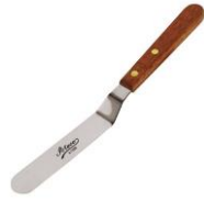
Dreamweaver PALETTE KNIFE Ateco 1385