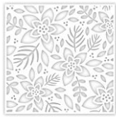
Simon Says Stamp Stencil WINTER...

Here are the supplies used. Where available I use Compensated Affiliate Links, which means if you make a purchase through my link, I receive a small commission at no extra cost to you. Thank you so very much for your support, I truly appreciate it.