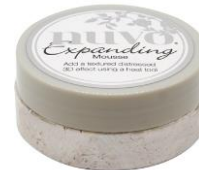
Tonic WORN LINEN Nuvo Expanding...