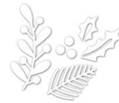
RESERVE Simon Says Stamp CHRISTMAS...