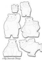
My Favorite Things POLAR BEAR PALS...