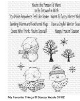
My Favorite Things WARM AND FEATHERED...