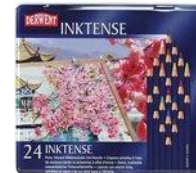
Derwent - Inktense Pencils - Ink...