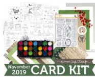
Simon Says Stamp Card Kit of The...

Here are the supplies used. Where available I use Compensated Affiliate Links, which means if you make a purchase through my link, I receive a small commission at no extra cost to you. Thank you so very much for your support, I truly appreciate it.