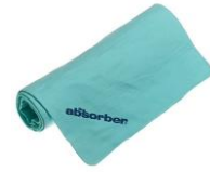
The AQUA Absorber Towel 17 x 27...