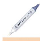
Copic Sketch MARKER E33