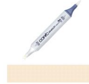
Copic Sketch Marker E31