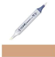
Copic Sketch Marker E25