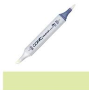
Copic Sketch Marker YG03 YELLOW GREEN