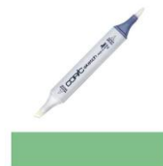
Copic Sketch Marker YG67 MOSS Dark Green