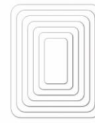
Simon Says Stamp ROUNDED CORNER...