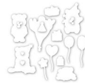
Simon Says Stamp PARTY LIKE A PANDA...