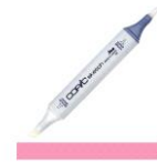
Copic Sketch Marker RV14 BEGONIA PINK...