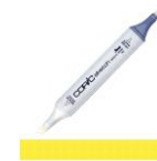
Copic Sketch Marker Y19 NAPOLI YELLOW...