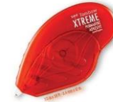
Tombow XTREME Permanent Adhesive Tape...