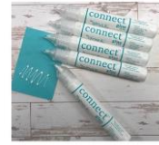
Gina K Designs CONNECT GLUE Adhesive...