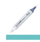
Copic Sketch Marker BG57 JASPER...