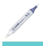
Copic Sketch Marker BG53 ICE MINT...