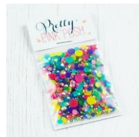
Pretty Pink Posh PARTY Jewels Mix