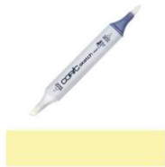
Copic Sketch Marker Y13 LEMON YELLOW