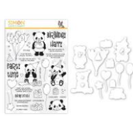
Simon Says Stamps and Dies PARTY LIKE...

Here are the supplies used. Where available I use Compensated Affiliate Links , which means if you make a purchase through my link, I receive a small commission at no extra cost to you. Thank you so very much for your support, I truly appreciate it.