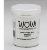
WOW! Embossing Powder OPAQUE BRIGHT...