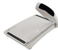
Tim Holtz Tonic GUILLOTINE COMFORT...