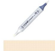
Copic Sketch Marker E31 BRICK BEIGE...