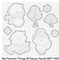
My Favorite Things WARM AND FEATHERED...