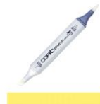
Copic Sketch MARKER Y15 CADMIUM YELLOW