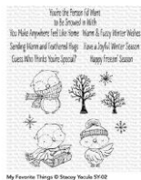
My Favorite Things WARM AND FEATHERED...

Here are the supplies used. Where available I use Compensated Affiliate Links , which means if you make a purchase through my link, I receive a small commission at no extra cost to you. Thank you so very much for your support, I truly appreciate it.