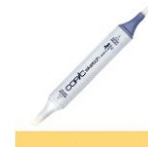
Copic Sketch Marker Y38 HONEY Bright...