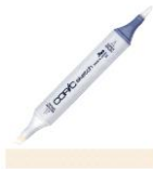
Copic Sketch Marker E40 BRICK WHITE