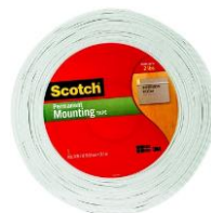
3M Scotch DOUBLE- SIDED FOAM TAPE...