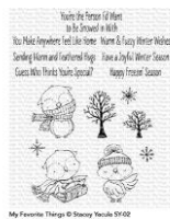
My Favorite Things WARM AND FEATHERED...

Here are the supplies used. Where available I use Compensated Affiliate Links , which means if you make a purchase through my link, I receive a small commission at no extra cost to you. Thank you so very much for your support, I truly appreciate it.