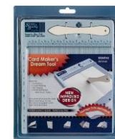
Scor-Pal MINI SCOR- BUDDY Scoring...