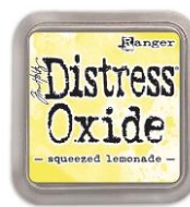
Tim Holtz Distress Oxide