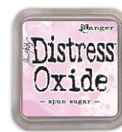
Tim Holtz Distress Oxide