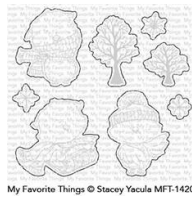
My Favorite Things WARM AND FEATHERED...