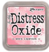
Tim Holtz Distress Oxide Ink Pad WORN...