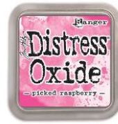
Tim Holtz Distress Oxide Ink Pad...