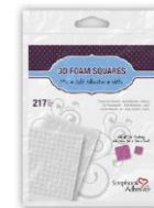
Scrapbook Adhesives - 3D Foam Squares...