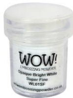
WOW Embossing Powder OPAQUE BRIGHT...