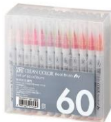
Zig CLEAN COLOR 60 SET Real