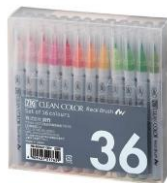
Zig CLEAN COLOR 36 SET Real Brush...