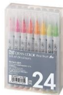
Zig CLEAN COLOR 24 SET Real Brush...