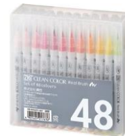
Zig CLEAN COLOR 48 SET Real Brush...