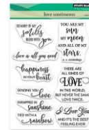
Penny Black Clear Stamps LOVE...