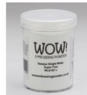
WOW Embossing Powder