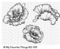
My Favorite Things POPPY BLOOMS Cling...

Please note this product list is for both cards in the set and not all products are used on both cards: