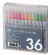
Zig CLEAN COLOR 36 SET Real Brush...