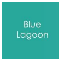
Gina K Designs - Cardstock - Blue Lagoon