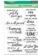
Penny Black Clear Stamps LOVE...