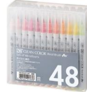
Zig CLEAN COLOR 48 SET Real Brush...