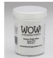
WOW Embossing Powder