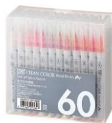
Zig CLEAN COLOR 60 SET Real