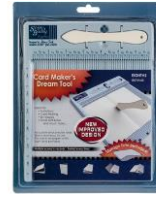
Scor-Pal MINI SCOR-BUDDY Scoring...