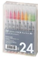
Zig CLEAN COLOR 24 SET Real Brush...