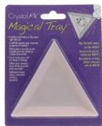
Beadsmith MAGICAL TRAY For...