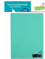
Lawn Fawn STAMP SHAMMY Cleaner LF1045