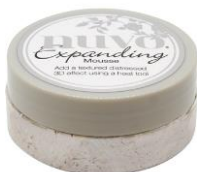
Tonic WORN LINEN Nuvo Expanding...