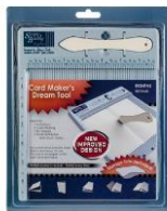
Scor-Pal MINI SCOR- BUDDY Scoring...