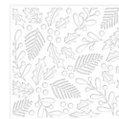
Simon Says Stamp Stencil HOLIDAY...