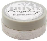
Tonic WORN LINEN Nuvo Expanding...