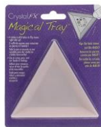
Beadsmith MAGICAL TRAY For...