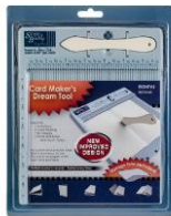
Scor-Pal MINI SCOR- BUDDY Scoring...