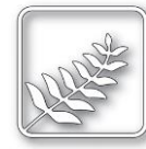
Simon Says Stamp FERN SQUARE Wafer...