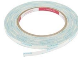
Scor-Tape 0.25 Inch Crafting Tape