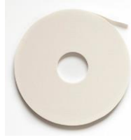
Simon Says Stamp BIG MOMMA FOAM TAPE...