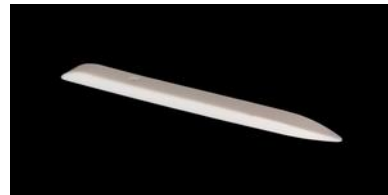
Simon Says Stamp SMALL TEFLON BONE...