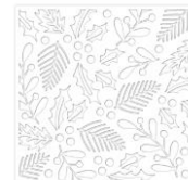
Simon Says Stamp Stencil HOLIDAY...