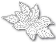
Memory Box RUFFLED POINSETTIA Craft...

Please note this supply list is for both cards although not all products are used on both cards: