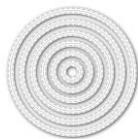
Simon Says Stamp STITCHED CIRCLES...