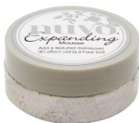
Tonic WORN LINEN Nuvo Expanding...