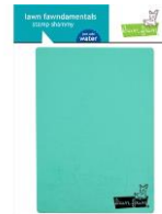
Lawn Fawn STAMP SHAMMY Cleaner LF1045