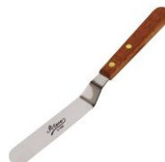
Dreamweaver PALETTE KNIFE Ateco 1385