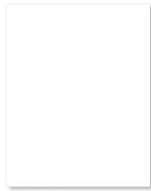
Neenah Classic Crest 110 LB SMOOTH...