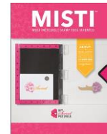
MISTI PRECISION STAMPER Stamping Tool...