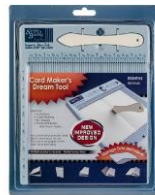
Scor-Pal MINI SCOR-BUDDY Scoring...