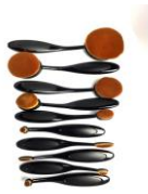
Picket Fence Studios LIFE CHANGING...