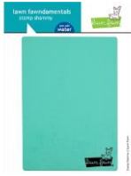
Lawn Fawn STAMP SHAMMY Cleaner LF1045