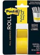
3M Scotch ROLL YELLOW MASKING TAPE...