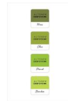
Altenew TROPICAL FOREST Mini Cube...