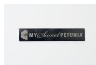
MISTI Neodymium BAR MAGNET 007070