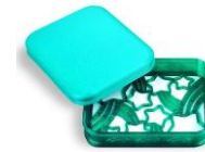
Lawn Fawn STARRY STAMP SHAMMY CASE...