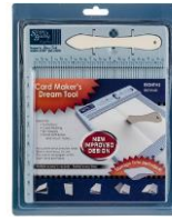
Scor-Pal MINI SCOR- BUDDY Scoring...