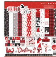
PhotoPlay KRINGLE AND CO 12 x 12...