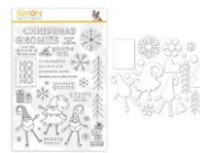
Simon Says Stamps And Dies GNOME FOR...

Here are the supplies used. Where available I use Compensated Affiliate Links, which means if you make a purchase through my link, I receive a small commission at no extra cost to you. Thank you so very much for your support, I truly appreciate it.