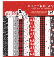
PhotoPlay KRINGLE AND CO 6 x 6 Paper...