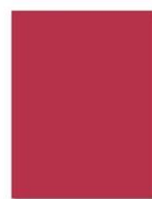
Simon Says Stamp Card Stock 100#...