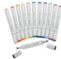
Copic 12 Bold BASIC SKETCH MARKER SET...