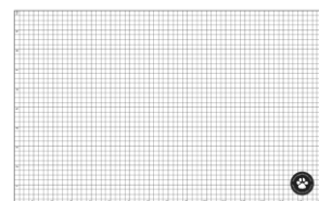
Simon Says Stamp LARGE GRID PAPER...