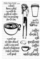
Picket Fence Studios COFFEE...

Please note this supply list is for both cards although not all products are used on both cards: