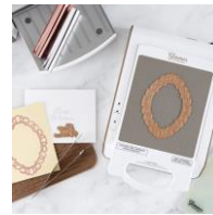
Glimmer Hot Foil System - Spellbinders