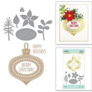
Ornament Glimmer Hot Foil Plate...

Here are the supplies used. Where available I use Compensated Affiliate Links , which means if you make a purchase through my link, I receive a small commission at no extra cost to you. Thank you so very much for your support, I truly appreciate it.