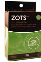
Zots MEDIUM Clear Adhesive Dots...