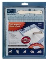
Scor-Pal MINI SCOR- BUDDY Scoring...