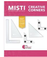
MISTI CREATIVE CORNERS Positioning...