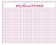
MISTI MOUSE PAD INSERT 000144