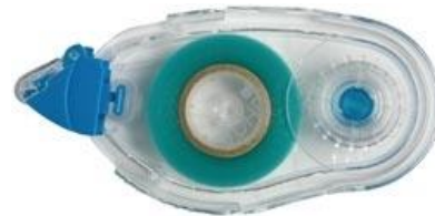
Tombow MONO Adhesive Dots Dispenser...