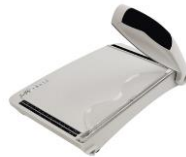
Tim Holtz Tonic GUILLOTINE COMFORT...