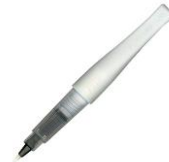
ZIG Wink of Stella GLITTER CLEAR...