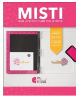
MISTI PRECISION STAMPER Stamping Tool...