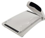
Tim Holtz Tonic GUILLOTINE COMFORT...