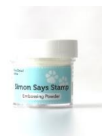
Simon Says Stamp EMBOSING