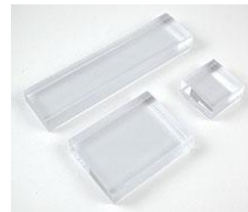
Hero Arts Rubber Stamp SMALL BLOCK...