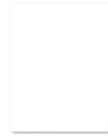
Neenah Classic Crest 110 LB SMOOTH...