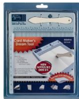
Scor-Pal MINI SCOR-BUDDY Scoring...