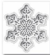
Simon Says Stamp SHIMMER SNOWFLAKE...