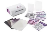
Crafters Companion - Gemini Junior...