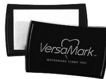
Tsukineko Versamark EMBOSS INK PAD...