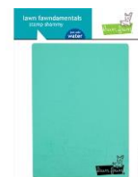
Lawn Fawn STAMP SHAMMY Cleaner