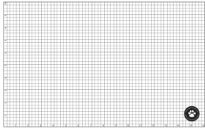
Simon Says Stamp LARGE GRID PAPER...