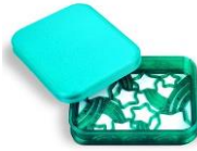
Lawn Fawn STARRY STAMP SHAMMY CASE...