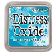
Tim Holtz Distress Oxide Ink Pad...