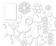
Simon Says Stamp GNOME FOR THE...