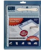
Scor-Pal MINI SCOR-BUDDY Scoring...