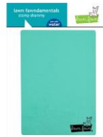
Lawn Fawn STAMP SHAMMY Cleaner LF1045