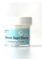
Simon Says Stamp EMBOSSING POWDER...