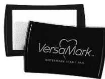
Tsukineko Versamark EMBOSS INK PAD...