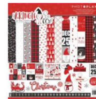
PhotoPlay KRINGLE AND CO 12 x 12...