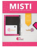
MISTI PRECISION STAMPER Stamping Tool...