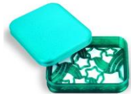
Lawn Fawn STARRY STAMP SHAMMY CASE...