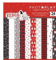
PhotoPlay KRINGLE AND CO 6 x 6 Paper...