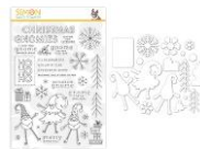
Simon Says Stamps And Dies GNOME FOR...