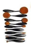
Picket Fence Studios LIFE CHANGING...