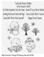
My Favorite Things WARM AND FEATHERED...

Here are the supplies used. Where available I use Compensated Affiliate Links, which means if you make a purchase through my link, I receive a small commission at no extra cost to you. Thank you so very much for your support, I truly appreciate it.