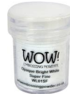
WOW Embossing Powder OPAQUE BRIGHT...