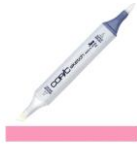
Copic Sketch Marker RV14 BEGONIA PINK...