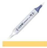
Copic Sketch Marker Y38 HONEY Bright...