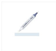
Copic Sketch Marker C1 COOL GRAY Grey