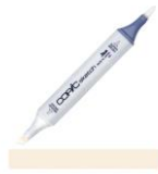
Copic Sketch Marker E40 BRICK WHITE...