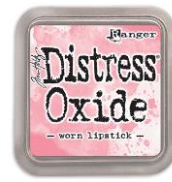
Tim Holtz Distress Oxide Ink Pad WORN...