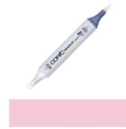
Copic Sketch Marker RV13 TENDER PINK...