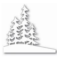
Memory Box ALPINE TREES Craft Die...