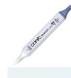
Copic Sketch MARKER C0 COOL GRAY NO. 0