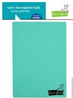
Lawn Fawn STAMP SHAMMY Cleaner LF1045