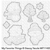
My Favorite Things WARM AND FEATHERED...