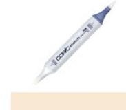
Copic Sketch Marker E31 BRICK BEIGE...