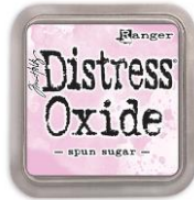
Tim Holtz Distress Oxide Ink Pad SPUN...