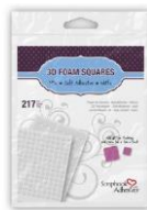
Scrapbook Adhesives - 3D Foam Squares...