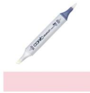
Copic Sketch MARKER RV11 PINK at...