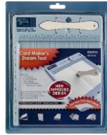
Scor-Pal MINI SCOR-BUDDY Scoring...