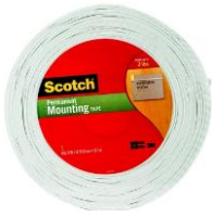
3M Scotch DOUBLE-SIDED FOAM TAPE...