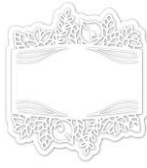
Simon Says Stamp ELEGANT FALL BLOOMS...

Here are the supplies used. Where available I use Compensated Affiliate Links, which means if you make a purchase through my link, I receive a small commission at no extra cost to you. Thank you so very much for your support, I truly appreciate it.