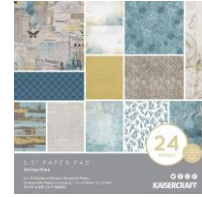
Kaisercraft ANTIQUITIES 6.5 Inch...