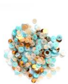
Simon Says Stamp Sequins