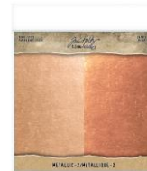
Tim Holtz Idea-ology 8 x 8 Paper...