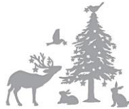
S4-1008 Spellbinders STARRY FOREST...

Here are the supplies used. Where available I use Compensated Affiliate Links , which means if you make a purchase through my link, I receive a small commission at no extra cost to you. Thank you so very much for your support, I truly appreciate it.