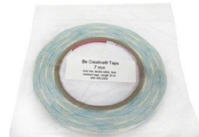
Be Creative Tape - 7mm (0.28")