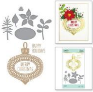
Glimmer - Hot Foil Plate & Dies -...

Here are the supplies used. Where available I use Compensated Affiliate Links, which means if you make a purchase through my link, I receive a small commission at no extra cost to you. Thank you so very much for your support, I truly appreciate it.