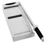
Tim Holtz - 12.25" Maxi Guillotine