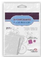
Scrapbook Adhesives - 3D Foam Squares...