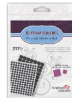
Scrapbook Adhesives - 3D Foam Squares...