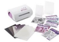
Crafters Companion - Gemini Junior...