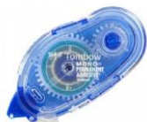
Tombow - Adhesive Standard Roller - ...