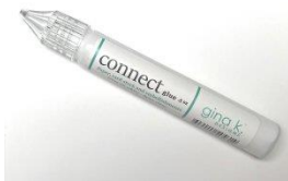
Gina K Designs - Adhesive - Connect Glue