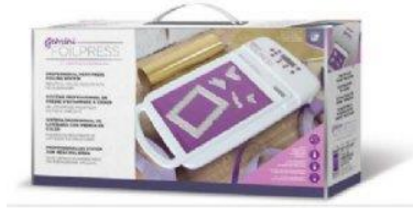
Gemini FoilPress - Machine