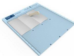
Scor-Pal - Tools - Measuring and...