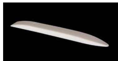
Bone Folder - Large (Solid Teflon)