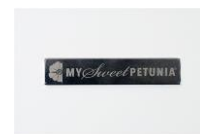
MISTI Neodymium BAR MAGNET 007070