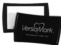
Tsukineko Versamark EMBOSS INK PAD...