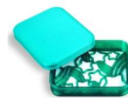
Lawn Fawn STARRY STAMP SHAMMY CASE...