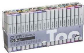
Copic SKETCH 72 PC SET E Markers EEES72E