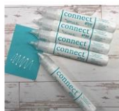
Gina K Designs CONNECT GLUE Adhesive...