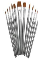
Tonic PAINT BRUSHES Nuvo 972n