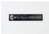
MISTI Neodymium BAR MAGNET 007070