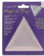
Beadsmith MAGICAL TRAY For...