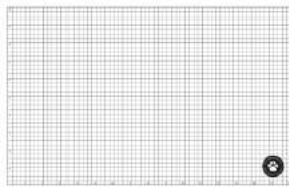
Simon Says Stamp LARGE GRID PAPER...