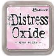
Tim Holtz Distress Oxide Ink Pad SPUN...