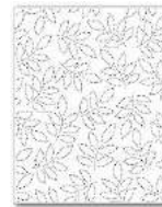
Memory Box PINPOINT LEAF PLATE Craft...