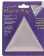
Beadsmith MAGICAL TRAY For...