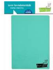
Lawn Fawn STAMP SHAMMY Cleaner LF1045