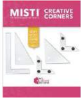
MISTI CREATIVE CORNERS Positioning...