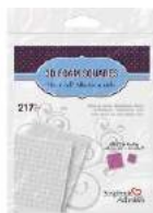
Scrapbook Adhesives 3D 217 WHITE FOAM...