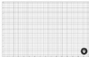
Simon Says Stamp LARGE GRID PAPER...