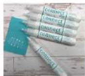
Gina K Designs CONNECT GLUE Adhesive...