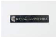
MISTI Neodymium BAR MAGNET 007070