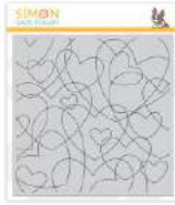
Simon Says Cling Stamp HEART TO HEART...