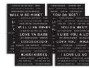
CZ Designs SENTIMENT STRIPS REVERSE...