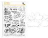
Simon Says Stamps And Dies LOVE...