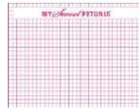
MISTI MOUSE PAD INSERT 000144