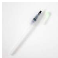
Medium WATERCOLOR BRUSH Pen MWCBP101...