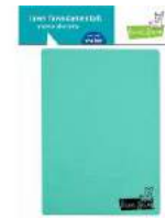
Lawn Fawn STAMP SHAMMY Cleaner LF1045