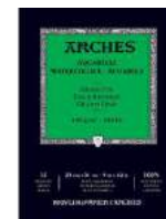
Arches COLD PRESSED WATERCOLOR PAD...