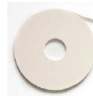
Simon Says Stamp BIG MOMMA FOAM TAPE...