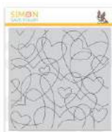
Simon Says Cling Stamp HEART TO HEART...