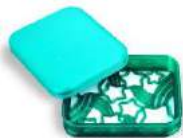
Lawn Fawn STARRY STAMP SHAMMY CASE...