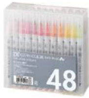
Zig CLEAN COLOR 48 SET Real Brush...