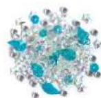
Buttons Galore and More Sparkletz...