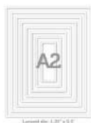
Simon Says Stamp A2 THIN FRAMES Wafer...

Here are the supplies used. Where available I use Compensated Affiliate Links, which means if you make a purchase through my link, I receive a small commission at no extra cost to you. Thank you so very much for your support, I truly appreciate it.