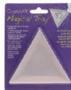
Beadsmith MAGICAL TRAY For...