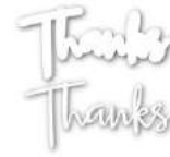
Simon Says Stamp SCRIPT THANKS Shadow...