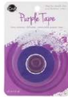
Therm O Web 0.5 INCH PURPLE TAPE Easy...