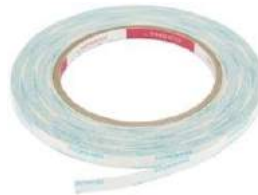
Scor-Tape 0.25 Inch Crafting Tape