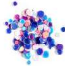
Simon Says Stamp Sequins BIRTHDAY...