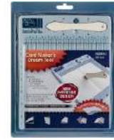
Scor-Pal MINI SCOR- BUDDY Scoring...