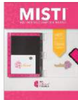
MISTI PRECISION STAMPER Stamping Tool...