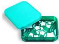
Lawn Fawn STARRY STAMP SHAMMY CASE...