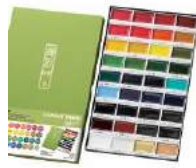
Zig Kuretake Gansai Tambi 36 COLOR SET