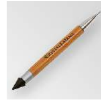
Crystal Ninja CRYSTAL KATANA Mixed...