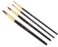
American Crafts Paper Fashion ROUND...