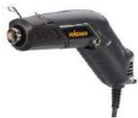
NEW 2020 Wagner Precision Heat Tool...