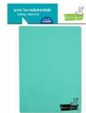
Lawn Fawn STAMP SHAMMY Cleaner LF1045