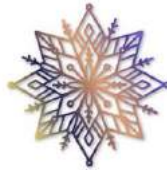
Simon Says Stamp SNOWFLAKE MANDALA...