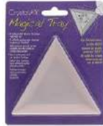
Beadsmith MAGICAL TRAY For...