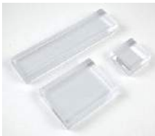
Hero Arts Rubber Stamp SMALL BLOCK...