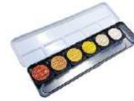
Finetec MICA WATERCOLOR PEARLESCENT...