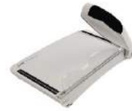
Tim Holtz Tonic GUILLOTINE COMFORT...