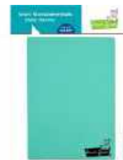
Lawn Fawn STAMP SHAMMY Cleaner LF1045