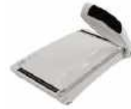
Tim Holtz Tonic GUILLOTINE COMFORT...