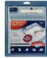
Scor-Pal MINI SCOR- BUDDY Scoring...