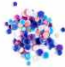
Simon Says Stamp Sequins BIRTHDAY...