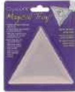
Beadsmith MAGICAL TRAY For...