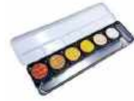
Finetec MICA WATERCOLOR PEARLESCENT...