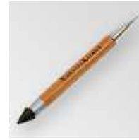
Crystal Ninja CRYSTAL KATANA Mixed...