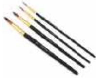
American Crafts Paper Fashion ROUND...