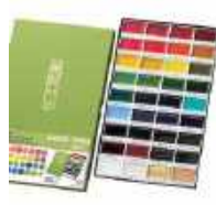
Zig Kuretake Gansai Tambi 36 COLOR SET