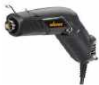
NEW 2020 Wagner Precision Heat Tool...