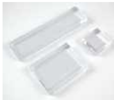
Hero Arts Rubber Stamp SMALL BLOCK...