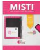
MISTI PRECISION STAMPER Stamping Tool...