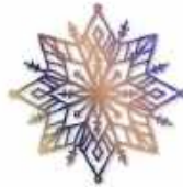
Simon Says Stamp SNOWFLAKE MANDALA...