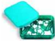
Lawn Fawn STARRY STAMP SHAMMY CASE...