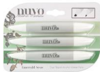
Tonic EMERALD SEAS Nuvo Creative Pen...