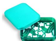
Lawn Fawn STARRY STAMP SHAMMY CASE...