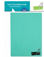
Lawn Fawn STAMP SHAMMY Cleaner LF1045