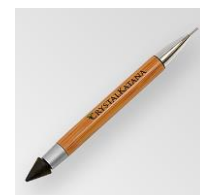
Crystal Ninja CRYSTAL KATANA Mixed...