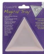
Beadsmith MAGICAL TRAY For...