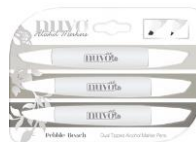
Tonic PEBBLE BEACH Nuvo Creative Pen...