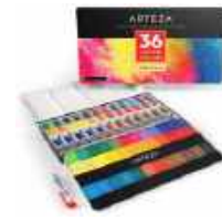
Watercolor Premium Artist Paint, Half...