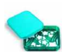
Lawn Fawn STARRY STAMP SHAMMY CASE...