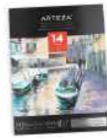
Watercolor Pad, Double-Sided, 14...