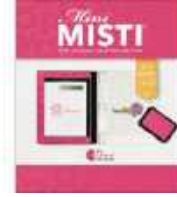
MINI MISTI PRECISION STAMPER Stamping...