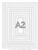
Simon Says Stamp A2 THIN FRAMES Wafer...