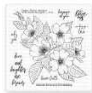
Picket Fence Studios WILD ROSE...