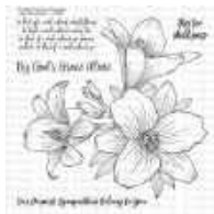
Picket Fence Studios LILY BOUQUET...

Here are the supplies used. Where available I use Compensated Affiliate Links , which means if you make a purchase through my link, I receive a small commission at no extra cost to you. Thank you so very much for your support, I truly appreciate it.