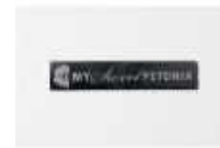
MISTI Neodymium BAR MAGNET 007070