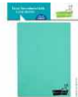
Lawn Fawn STAMP SHAMMY Cleaner LF1045