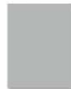
Simon Says Stamp Card Stock 100#...