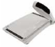
Tim Holtz Tonic GUILLOTINE COMFORT...