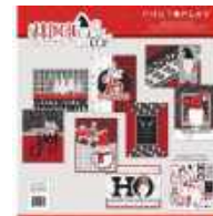
PhotoPlay KRINGLE AND CO Card Kit...