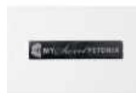
MISTI Neodymium BAR MAGNET 007070