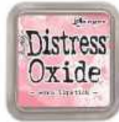
Tim Holtz Distress Oxide Ink Pad WORN...