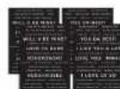
CZ Designs SENTIMENT STRIPS REVERSE...