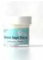
Simon Says Stamp EMBOSsing POWDER...