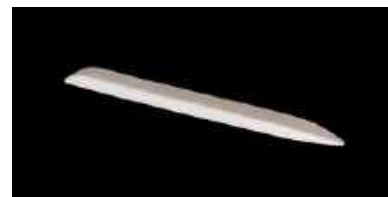
Simon Says Stamp SMALL TEFLON BONE...