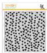
Simon Says Cling Stamp HEART GARLAND...

Here are the supplies used. Where available I use Compensated Affiliate Links , which means if you make a purchase through my link, I receive a small commission at no extra cost to you. Thank you so very much for your support, I truly appreciate it.