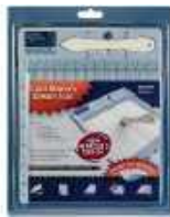
Scor-Pal MINI SCOR-BUDDY Scoring...