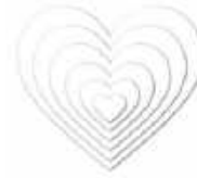
Simon Says Stamp NESTED HEARTS Wafer...