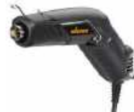
NEW 2020 Wagner Precision Heat Tool...