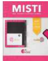
MISTI PRECISION STAMPER Stamping Tool...