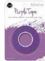
Therm O Web PURPLE TAPE Easy Release...