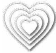
Memory Box DOUBLE STITCH LOVING HEART...