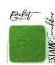
Picket Fence Studios THE STAMP...