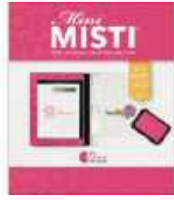
MINI MISTI PRECISION STAMPER Stamping...