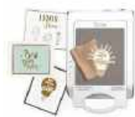
GLS-001EUK Spellbinders GLIMMER HOT...