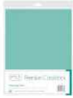
Therm O Web Gina K Designs TURQUOISE...