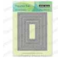
Penny Black LEAF STITCHED FRAMES Thin...