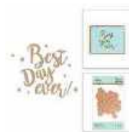
Spellbinders - Glimmer Hot Foil -...