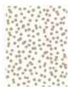
GLP-075 Spellbinders SCATTERED DOT...