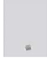
Bazzill 40 LB VELLUM 8.5 x 11 White...