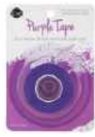
Therm O Web 0.5 INCH PURPLE TAPE Easy...