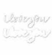
Simon Says Stamp I LOVE YOU Shadow...