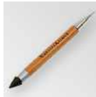
Crystal Ninja CRYSTAL KATANA Mixed...