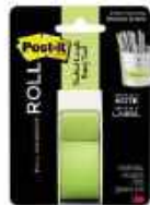
3M Scotch ROLL GREEN MASKING TAPE...