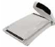
Tim Holtz Tonic GUILLOTINE COMFORT...