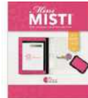
MINI MISTI PRECISION STAMPER Stamping...