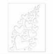
Simon Says Stamp Stencil BURSTING...