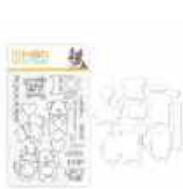
Simon Says Stamps And Dies PAWSOME...

Here are the supplies used. Where available I use Compensated Affiliate Links , which means if you make a purchase through my link, I receive a small commission at no extra cost to you. Thank you so very much for your support, I truly appreciate it.