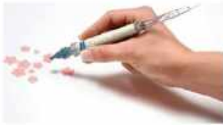
We R Memory Keepers QUICKSTIK...