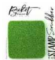
Picket Fence Studios THE STAMP...