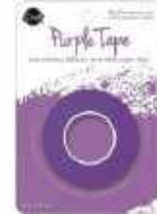
Therm O Web PURPLE TAPE Easy Release...