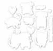
Simon Says Stamp PAWSOME LOVE Wafer...