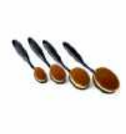
Picket Fence Studios LIFE CHANGING...