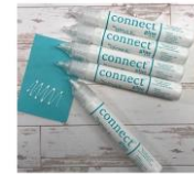
Gina K Designs CONNECT GLUE Adhesive... [ SSS ]