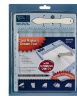
Scor-Pal MINI SCOR- BUDDY Scoring...