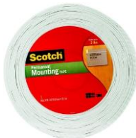
3M Scotch DOUBLE-SIDED FOAM TAPE... [ SSS ]