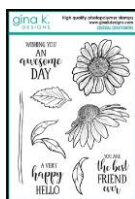
Gina K Designs COLOSSAL CONEFLOWERS...

Here are the supplies used. Where available I use Compensated Affiliate Links , which means if you make a purchase through my link, I receive a small commission at no extra cost to you. Thank you so very much for your support, I truly appreciate it.