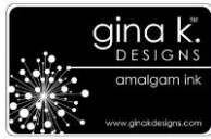
Gina K Designs JET BLACK AMALGAM Ink...