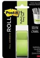
3M Scotch ROLL GREEN MASKING TAPE... [ SSS ]