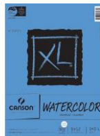
Canson XL WATERCOLOR PAPER 9x12 140lb... [ SSS ]