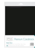
Therm O Web Gina K Designs BLACK ONYX... [ SSS ]