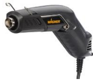
NEW 2020 Wagner Precision Heat Tool...