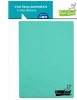
Lawn Fawn STAMP SHAMMY Cleaner LF1045 [ SSS ]