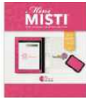
MINI MISTI PRECISION STAMPER Stamping...