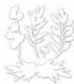
Simon Says Stamp BE KIND Wafer Dies...