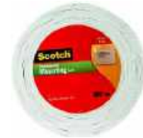
3M Scotch DOUBLE-SIDED FOAM TAPE...