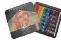
Prismacolor PREMIER COLORED PENCILS...