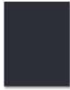
Simon Says Stamp Card Stock 100#...