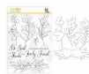
Simon Says Stamps And Dies BE KIND...