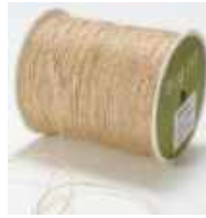
May Arts NATURAL Twine String Burlap...