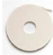
Simon Says Stamp BIG MOMMA FOAM TAPE...