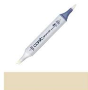
Copic Sketch MARKER E43 DULL IVORY...