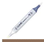
Copic Sketch MARKER e47 DARK BROWN