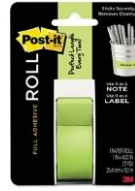
3M Scotch ROLL GREEN MASKING TAPE...