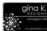
Gina K Designs JET BLACK AMALGAM Ink...