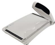
Tim Holtz Tonic GUILLOTINE COMFORT...