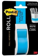
3M Scotch ROLL MEDITERANNEAN BLUE...