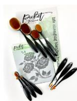
Picket Fence Studios LIFE CHANGING...