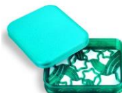
Lawn Fawn STARRY STAMP SHAMMY CASE...