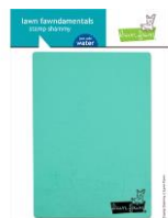
Lawn Fawn STAMP SHAMMY Cleaner LF1045