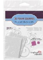
Scrapbook Adhesives 3D 217 WHITE FOAM...