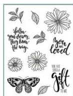
Gina K Designs ELEGANT ASTER Clear...

Here are the supplies used. Where available I use Compensated Affiliate Links, which means if you make a purchase through my link, I receive a small commission at no extra cost to you. Thank you so very much for your support, I truly appreciate it.