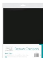
Therm O Web Gina K Designs BLACK ONYX...