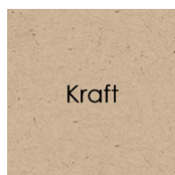
Heavy Base Weight Card Stock- Kraft -...