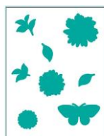
Gina K Designs ELEGANT ASTER Die Set...