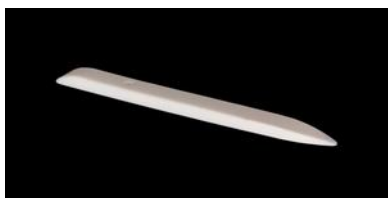
Simon Says Stamp SMALL TEFLON BONE...