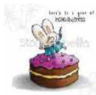
Stamping Bella - Cling Stamp - Happy...

Here are the supplies used. Where available I use Compensated Affiliate Links, which means if you make a purchase through my link, I receive a small commission at no extra cost to you. Thank you so very much for your support, I truly appreciate it.