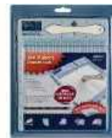
Scor-Pal MINI SCOR-BUDDY Scoring...