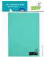
Lawn Fawn STAMP SHAMMY Cleaner LF1045