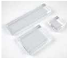
Hero Arts Rubber Stamp SMALL BLOCK...