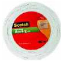
3M Scotch DOUBLE- SIDED FOAM TAPE...