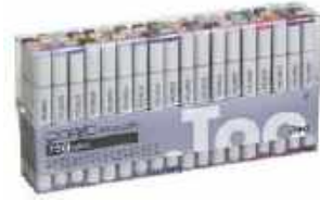
Copic SKETCH 72 PC SET E Markers EEES72E