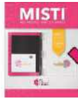
MISTI PRECISION STAMPER Stamping Tool...