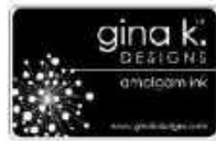
Gina K Designs JET BLACK AMALGAM Ink...