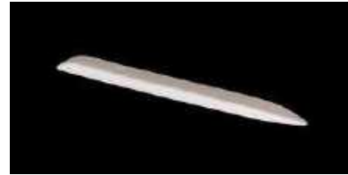
Simon Says Stamp SMALL TEFLON BONE...