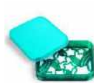
Lawn Fawn STARRY STAMP SHAMMY CASE...