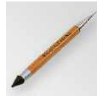
Crystal Ninja CRYSTAL KATANA Mixed...