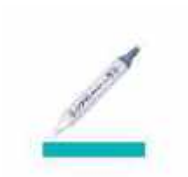
Copic Sketch Marker BG49 DUCK BLUE at...