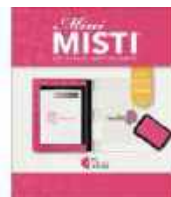
MINI MISTI PRECISION STAMPER Stamping...