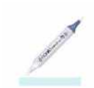
Copic Sketch Marker BG11 MOON WHITE...