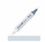
Copic Sketch MARKER C2 COOL GRAY NO...