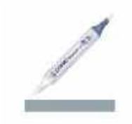
Copic Sketch MARKER C5 COOL GRAY Grey...