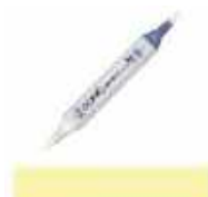
Copic Sketch Marker Y13 LEMON YELLOW...