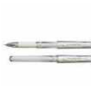
Uni-Ball Pen Signo Gel WHITE UM-153...