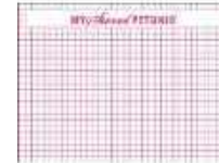
MISTI MOUSE PAD INSERT 000144