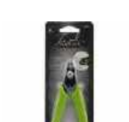
Tool Basics FLUSH CUTTERS 4463