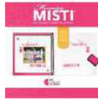
MISTI MEMORY MISTI PRECISION STAMPER...