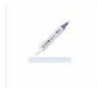
Copic Sketch Marker C1 COOL GRAY Grey...