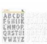
Simon Says Stamps And Dies ORNATE...