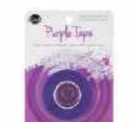
Therm O Web 0.5 INCH PURPLE TAPE Easy...