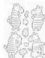
My Favorite Things ZIPPY ZEBRAS...