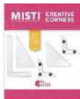
MISTI CREATIVE CORNERS Positioning...