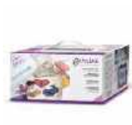
Crafter's Companion GEMINI JUNIOR...