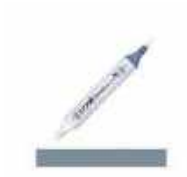
Copic Sketch MARKER C6 COOL GRAY NO...