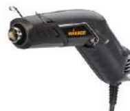
NEW 2020 Wagner Precision Heat Tool...