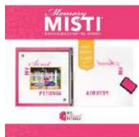
MISTI MEMORY MISTI PRECISION STAMPER...