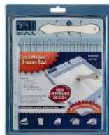
Scor-Pal MINI SCOR-BUDDY Scoring...