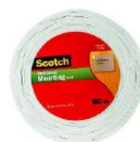
3M Scotch DOUBLE- SIDED FOAM TAPE...