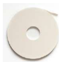
Simon Says Stamp BIG MOMMA FOAM TAPE...