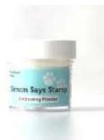
Simon Says Stamp EMBOSSING POWDER...