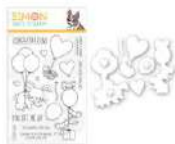
Simon Says Stamps And Dies LIFTING...

Here are the supplies used. Where available I use Compensated Affiliate Links , which means if you make a purchase through my link, I receive a small commission at no extra cost to you. Thank you so very much for your support, I truly appreciate it.