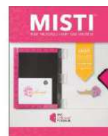
MISTI PRECISION STAMPER Stamping