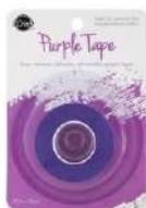
Therm O Web 0.5 INCH PURPLE TAPE Easy...