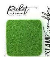
Picket Fence Studios THE STAMP...