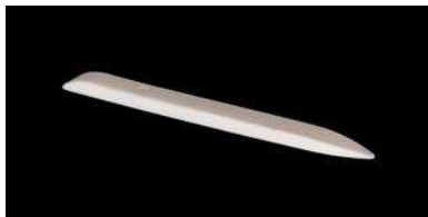
Simon Says Stamp SMALL TEFLON BONE...