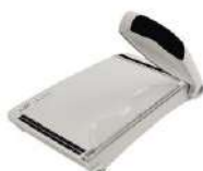
Tim Holtz Tonic GUILLOTINE COMFORT...