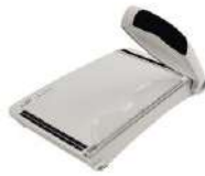
Tim Holtz Tonic GUILLOTINE COMFORT...