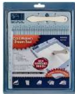
Scor-Pal MINI SCOR- BUDDY Scoring...