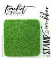
Picket Fence Studios THE STAMP...