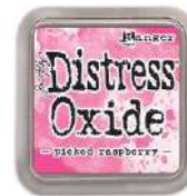
Tim Holtz Distress Oxide Ink Pad...