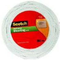
3M Scotch DOUBLE- SIDED FOAM TAPE...