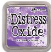
Tim Holtz Distress Oxide Ink Pad...