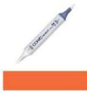
Copic Sketch Marker YR18 SANGUINE...