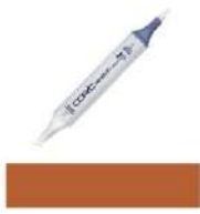
Copic Sketch MARKER E99 BAKED CLAY at...