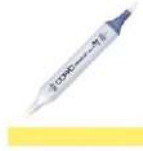
Copic Sketch MARKER Y15 CADMIUM...