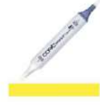
Copic Sketch Marker Y19 NAPOLI YELLOW...