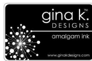
GKD Amalgam Ink Pad- Obsidian - Gina...