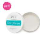
Glitz Glitter Gel- White - Gina K...