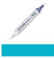
Copic Sketch Marker BG07 PETROLEUM...