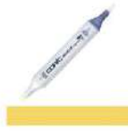
Copic Sketch MARKER YR24 PALE SEPIA...