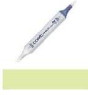
Copic Sketch Marker YG03 YELLOW GREEN...