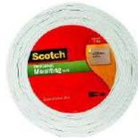
3M Scotch DOUBLE-SIDED FOAM TAPE...