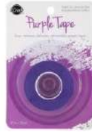
Therm O Web 0.5 INCH PURPLE TAPE Easy...