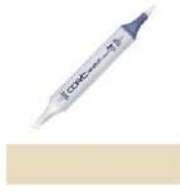
Copic Sketch MARKER E43 DULL IVORY...