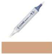
Copic Sketch Marker E25 CARIBE COCOA...