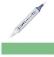
Copic Sketch Marker YG67 MOSS Dark...