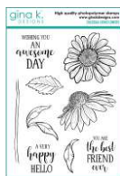
Clear Stamps- Colossal Coneflower -...

Here are the supplies used. Where available I use Compensated Affiliate Links, which means if you make a purchase through my link, I receive a small commission at no extra cost to you. Thank you so very much for your support, I truly appreciate it.