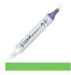
Copic Sketch Marker YG17 GRASS GREEN...