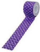
Therm O Web 0.5 INCH PURPLE TAPE Easy...