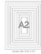
Simon Says Stamp A2 THIN FRAMES Wafer...