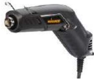
NEW 2020 Wagner Precision Heat Tool...