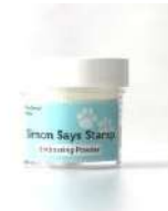
Simon Says Stamp EMBOSSING POWDER...