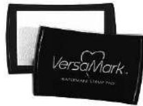
Tsukineko Versamark EMBOSS INK PAD...