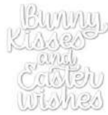
Simon Says Stamp BUNNY KISSES Wafer...