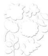
Simon Says Stamp EVEN MORE SPRING...