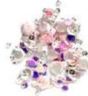
Simon Says Stamp Sequins GIRL'S BEST...