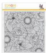
Simon Says Cling Rubber Stamp FLORAL...

Here are the supplies used. Where available I use Compensated Affiliate Links, which means if you make a purchase through my link, I receive a small commission at no extra cost to you. Thank you so very much for your support, I truly appreciate it.