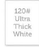
Simon Says Stamp WHITE CARDSTOCK 120...